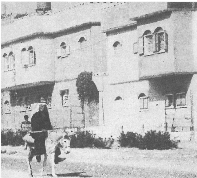
The myth of resettlement: Only 20 of these model housing units were completed.